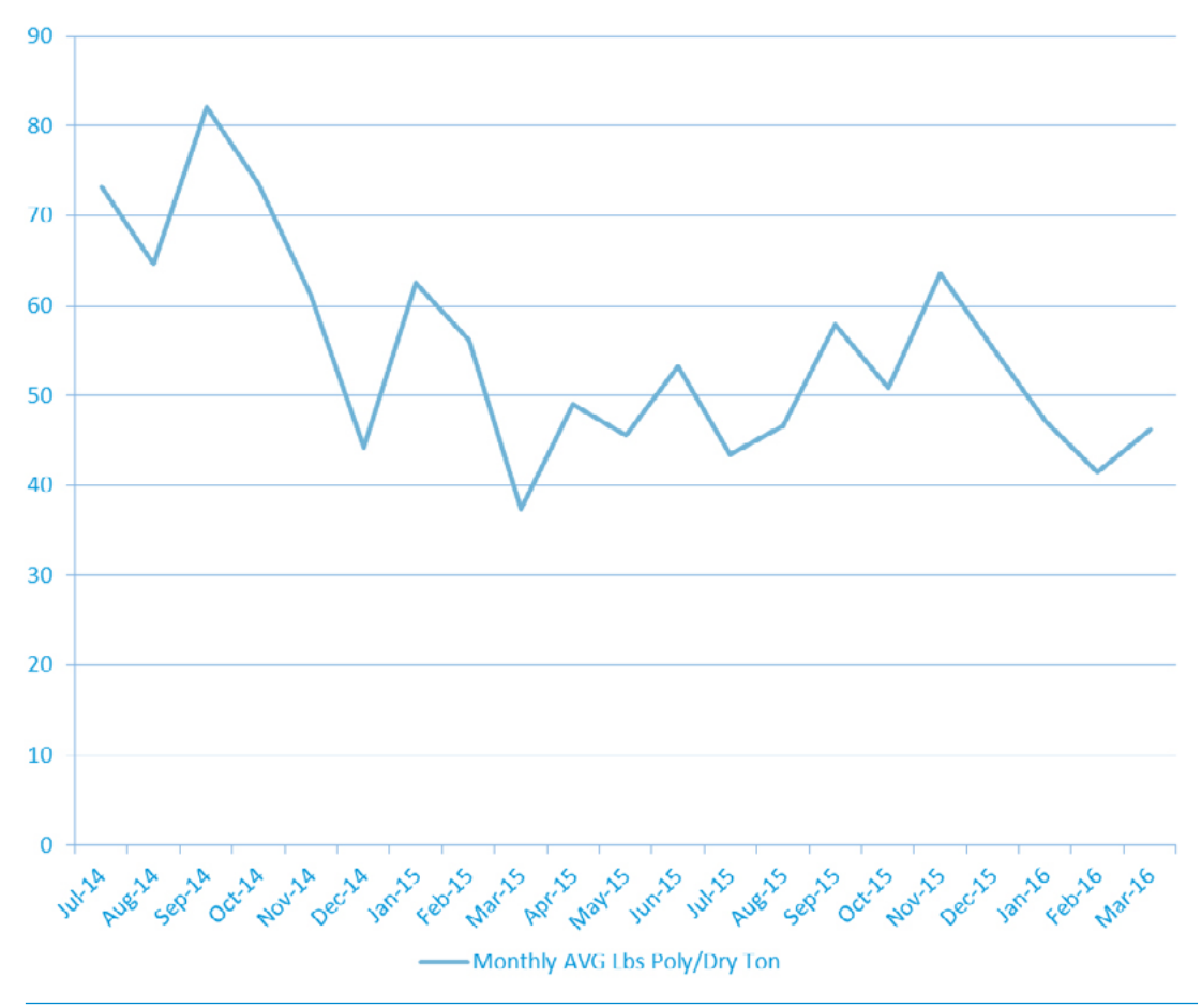
Figure 3: BGMU introduced RTC-SD in October 2014, leading to optimized polymer consumption

With real-time, continuous monitoring of TSS concentrations from RTC-SD, BGMU gained greater insight and clarity into its sludge concentration, flow, and polymer needs. This leads to greater process control and efficiency. Specifically, BGMU reports that RTC-SD helped reduce manual centrifuge operation for sludge treatment by 70%. This allowed operators to focus on other critical plant operations, and optimizations from RTC-SD (along with other changes such as a shift in polymer) contributed to BGMU reducing its polymer consumption by 58% while RTC-SD is running (see Figure 3).