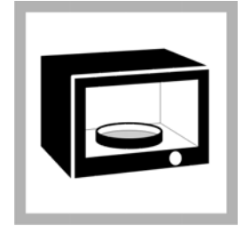
7. Label the petri dish with the sample number, dilution and date. Invert the petri dish and incubate at 35 \pm 0.5 °C for 48 hours.