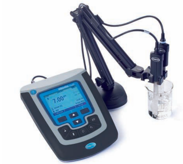
HQD benchtop multi-meter