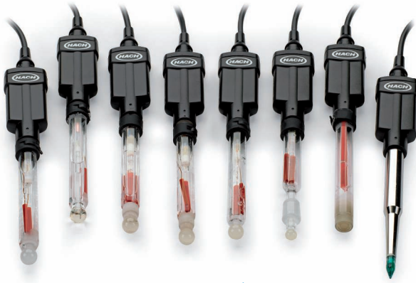
PHC705 PHC805 PHC725 PHC735 PHC705A PHC745 PHC729 PHC108

Full specifications of the electrodes featured in the table are available on our website or you can call your local office.